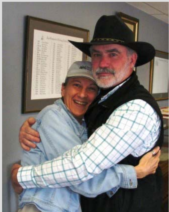
"To Close for Comfort!" All About Horses - Lindsay

Ontario Visited P.O. Box 272 Cobourg, ON K9A 4K8 CANADA Phone/Fax: 1-888-818-0255 E-mail: info@ontariovisited.ca