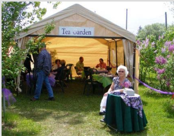
"Tea Garden" Lindsay Lilac Festival