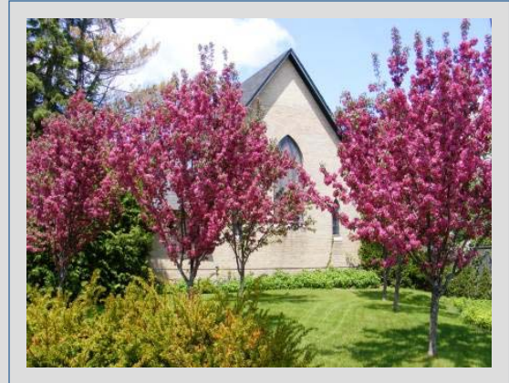
"Lilacs in Bloom" Warkworth Lilac Festival