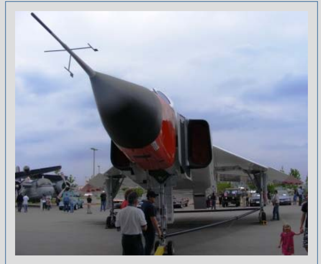
"The Avro Arrow Wings & Wheels Heritage Festival

Please see THE INSIDE SCOOP... on page 5