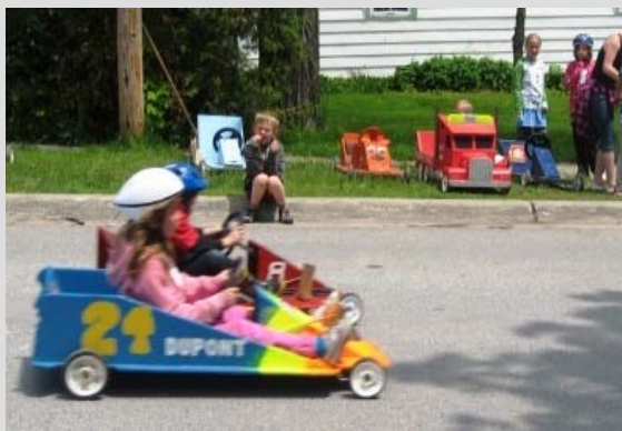
"The Winner Is?" Colborne Apple Blossom Tyme Festival