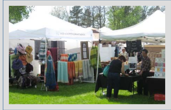
"Vendor Booths" Warkworth Art in the Park