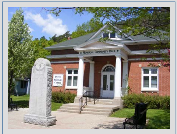
"Warkworth Community Hall" Village of Warkworth