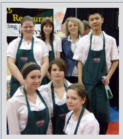
"Serving Staff" Eat & Drink Norfolk